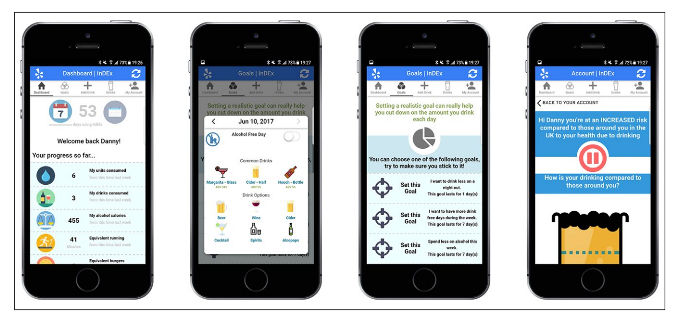
Figure 1: Example screenshots captured from the InDEx app.

Screening and Normative Feedback: This module consists of two elements. First, at specific periods during the app life-cycle ( e.g. day 0, 7, 14, 21 and 28) users are