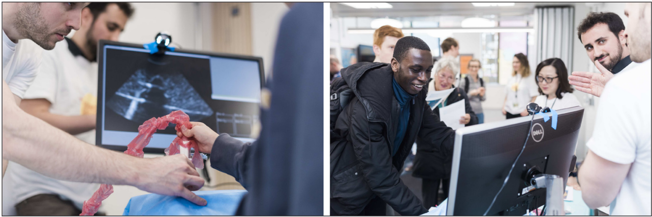
Figure 3: The software in use during our “Science of Surgery” event. We attached a printed ArUco tag to an obsolete ultrasound probe to provide a sense of realism. The user moves the probe over a plastic torso phantom, the probe is tracked by a webcam on top of the monitor, and the ultrasound image shown changes depending on where the probe is over the phantom.

theatre. The software described in this paper falls outside the QMS as it is not a medical device, however we take care to follow as much of the standard as practical, to allow the component software to be used in a medical device at some future date.